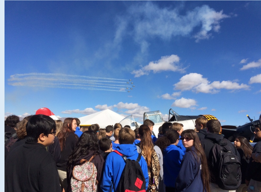
Heritage Aircraft Display Area