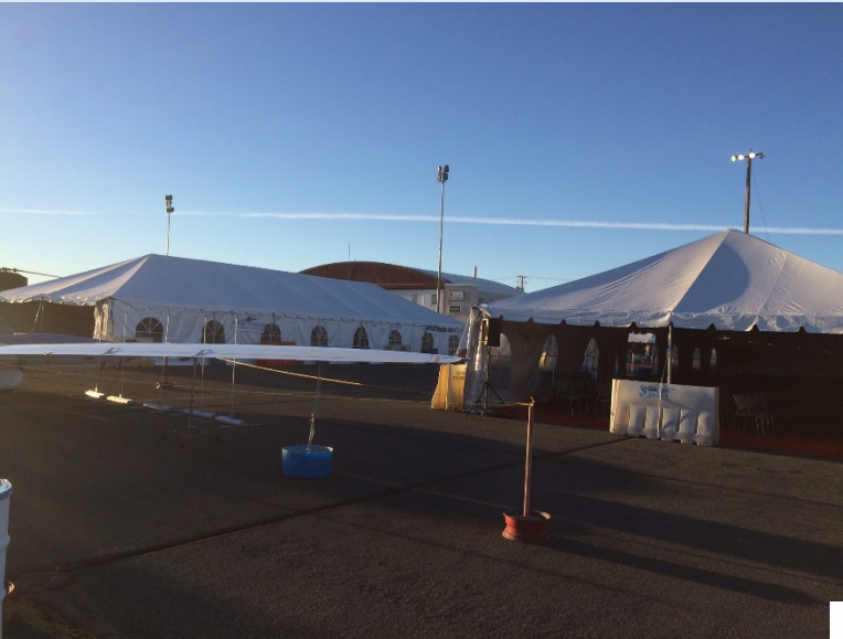
Aviation Learning Center