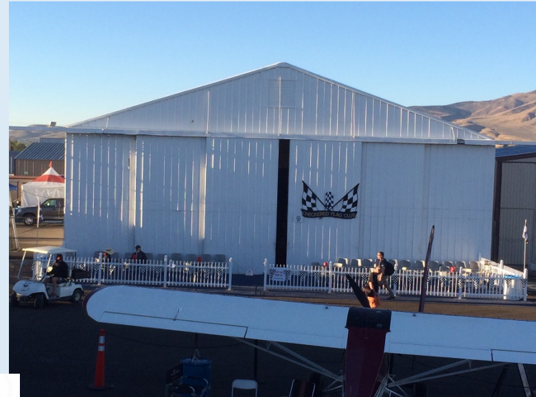
Checked Flag Club