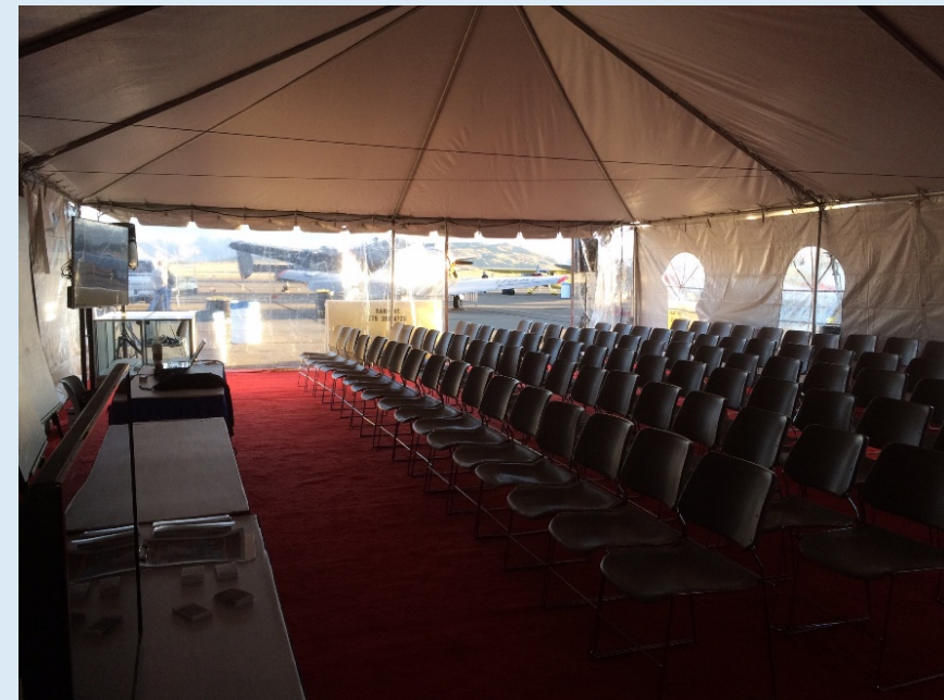
Aviation Learning Center Classroom Area